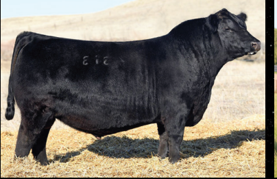
COLEMAN BRAVO 6313 Sire of Lot 2A and 2B

Pollyanna 22P's name graces more pedigrees then any other female in the history of YDF. Claiming the title of Farm Fair Supreme Champion Female, we still drive the truck she won us in Edmonton. This female's victories did not just occur in the show ring, 22P is the dam of Panarama 66T, who without a doubt made some of the thickest cattle out there, with hair in abundance. No matter the years that have passed, this female is still extremely current for today's livestock marketplace. Huge topped, big footed cattle that are all wrapped up in an attractive package and bred to produce will never go out of style with the trends. Make special note of the Bravo matings on offer, it is truly an opportunity that is guaranteed to click.