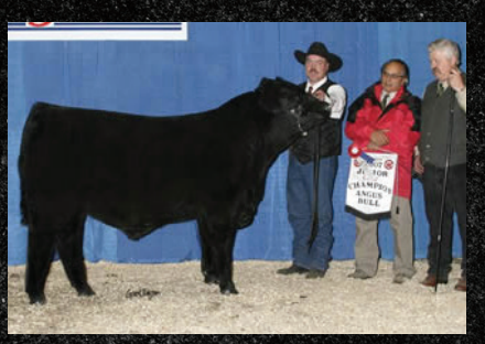
YOUNG DALE PANARAMA 66T Son of Pollyanna 22P