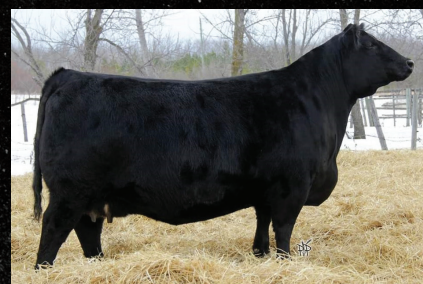
YOUNG DALE GRACE 169B A highly productive and profitable Grace