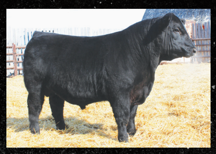
$46,000 1/2 interest son of Grace 126Z