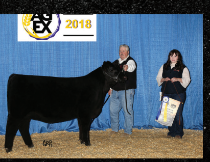
YOUNG DALE POLLYANNA IF Daughter of Pollyanna 22P