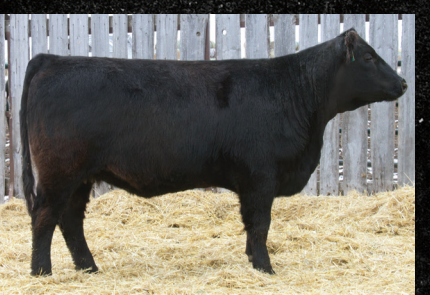
Daughter of Countess 417T