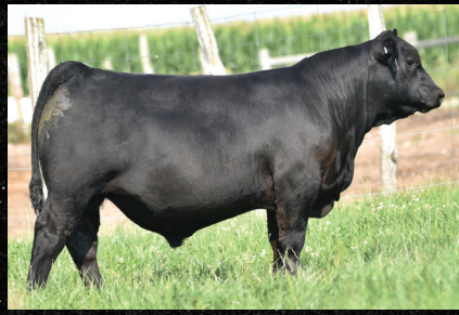
Son of Defiance 199F