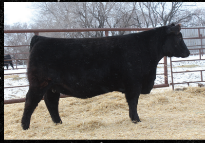
YOUNG DALE POLLYANNA 38E $17,000 daughter of Pollyanna 30U