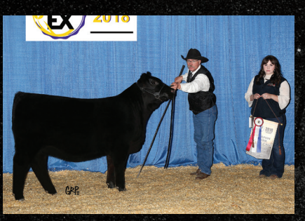
YOUNG DALE POLLYANNA 4F $20,000 Daughter of Pollyanna 22P