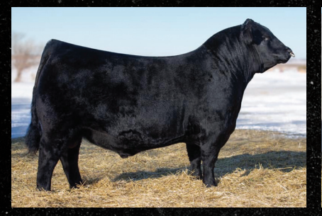
YOUNG DALE DEFIANCE 199F $55,000 1/2 interest son of Grace 126Z