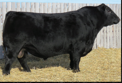
$146,000 son of Grace 126Z