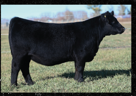
BLAIRSWEST MISS ERICA 13 Daughter of Defiance 199F