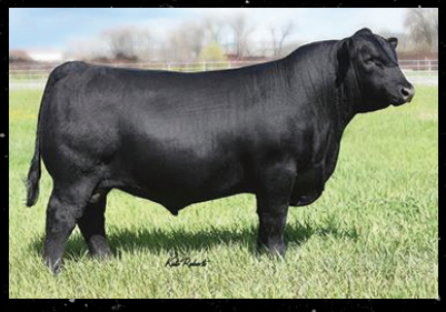
MUSGRAVE 316 STUNNER Sire of Lot 4C