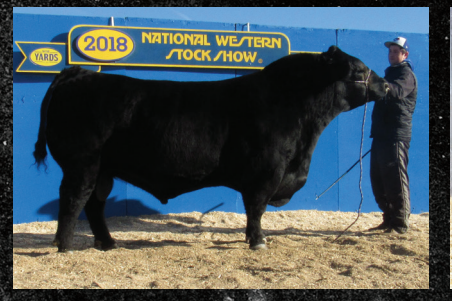
2 time RBC Supreme finalist, son of 417T